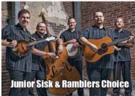
Junior Sisk & Ramblers Choice