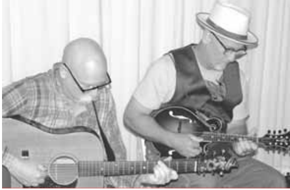
SEE FLYER PAGE 8